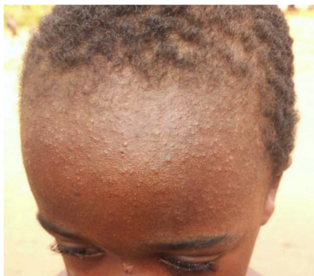
Figure 4. Image from the World Health Organization Regional Office for Africa