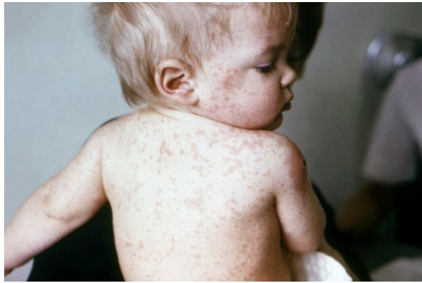
Figure 6.