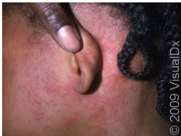
Figure 3. Image from Skinsight