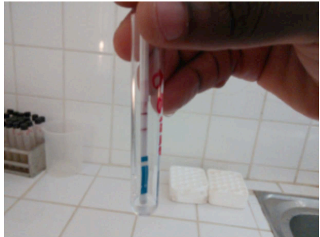
A positive sample