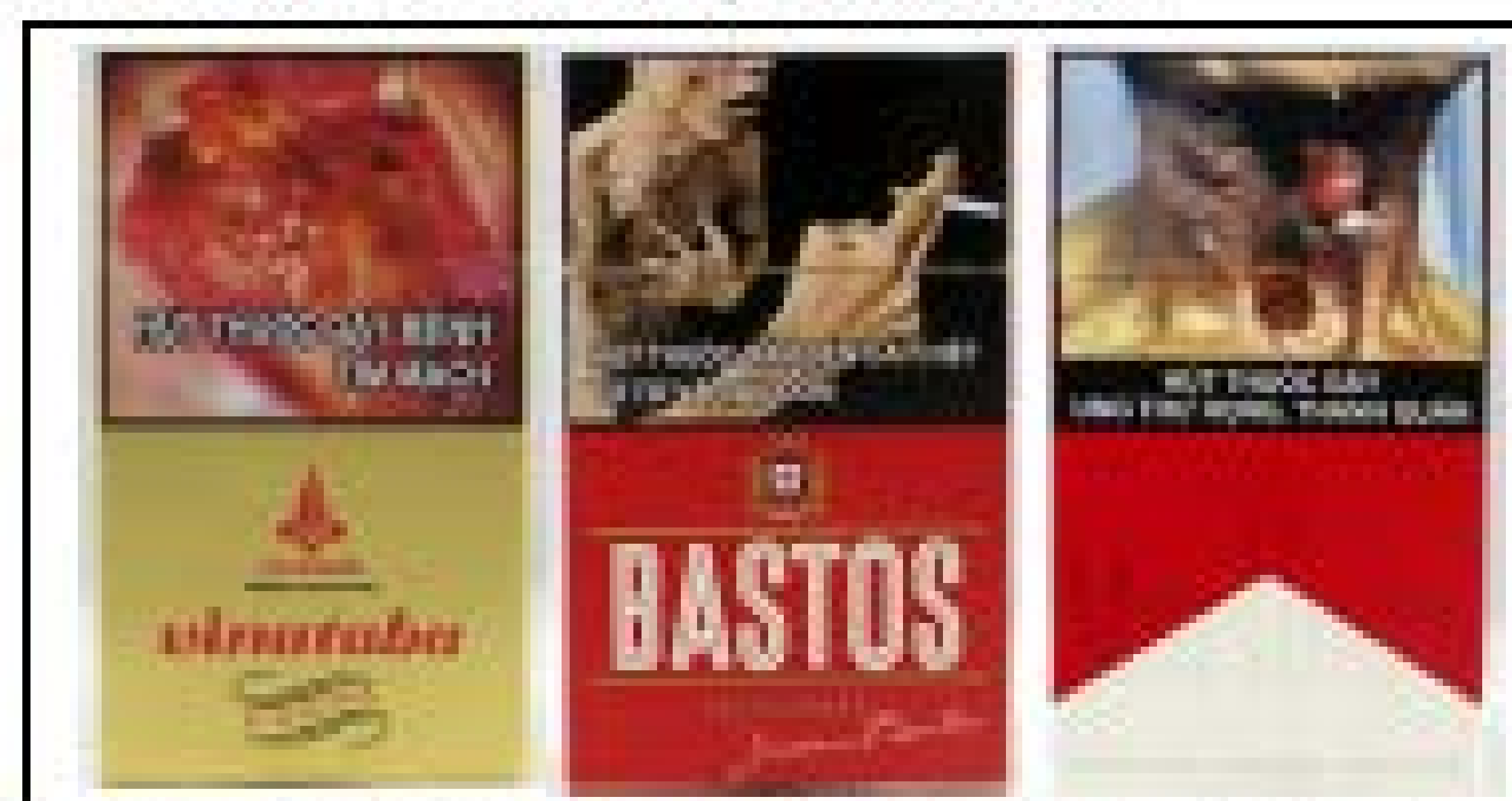
Left to right: National brand (Vinataba, Vietnam National Tobacco), International brand (Bastos, Imperial), Marlboro Red (PMI)