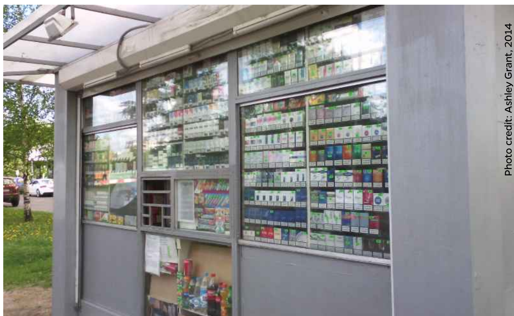
Figure 1. Kiosk with cigarettes on display in Moscow, Russia (April 2014)